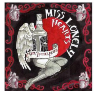
Crying Bottle Blues (2012)