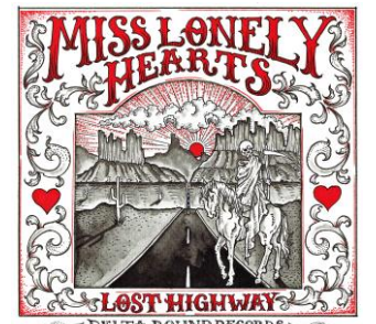
Lost Highway (2016)